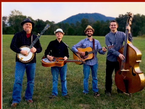
Father/Son group, Grassicallly Trained on site providing live entertainment!

Tickets: $12 (adults), $8 (kids 6-10), kids 5 & under are free.